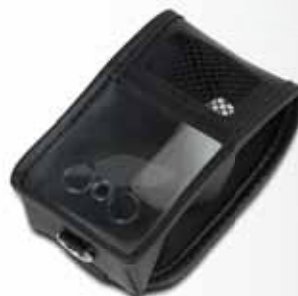
MX4 Soft-sided Case