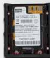
MX4 Li-ion Battery