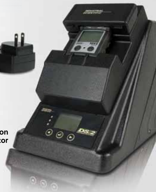
MX4 DS2 Docking Station shown with MX4 Monitor

Supplied with Monitor: charger, belt clip, calibration cup with tubing.