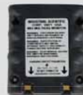
MX4 Alkaline Battery