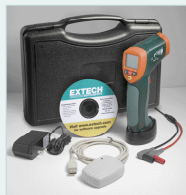
Includes software and accessories