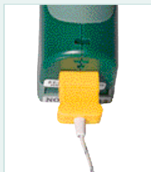
Type K input for contact measurements