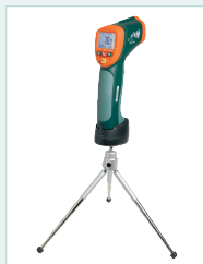
Tripod included for continuous measurement using the lock feature